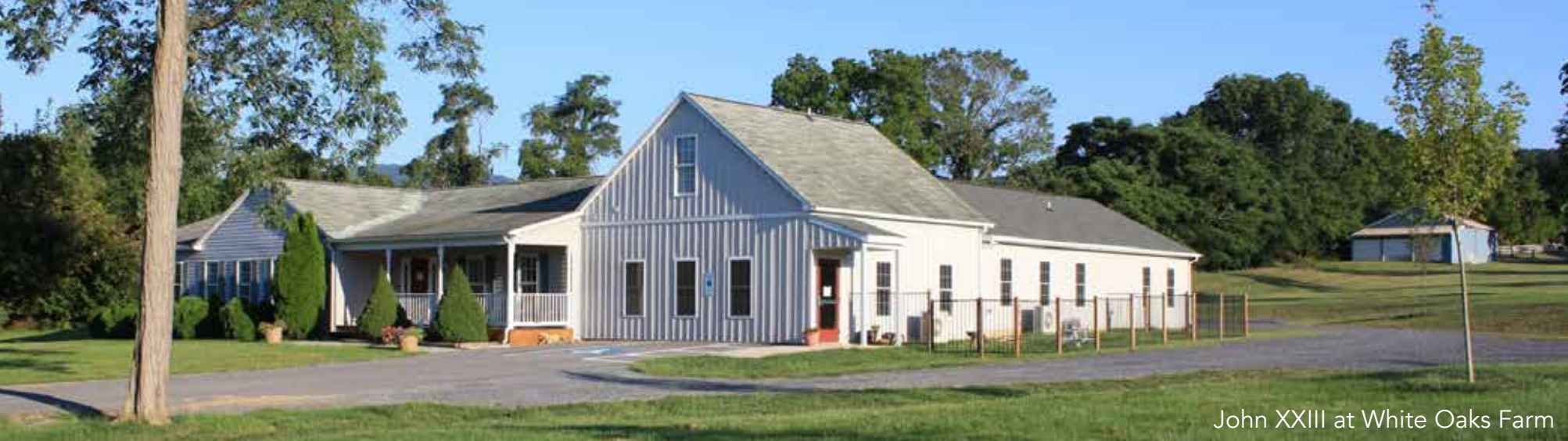
John XXIII at White Oaks Farm